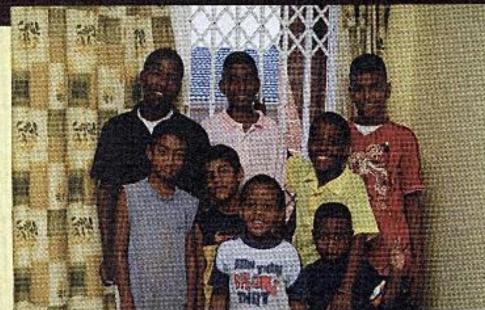
Young residents of the ABH Bhai Rambharos Children's Home in Chatsworth are safe behind Trellidors, donated to seven cottages after several incidents of crime.