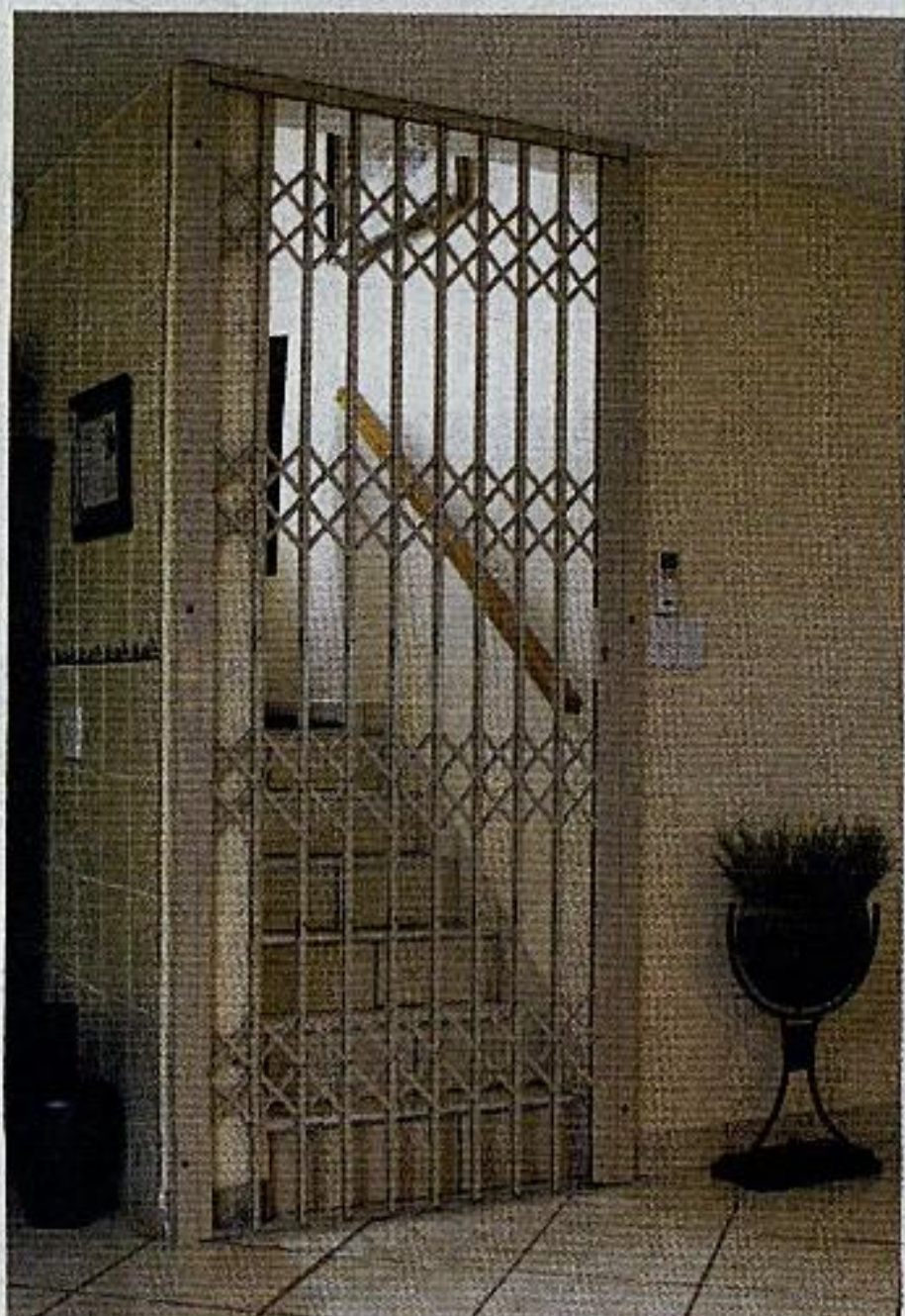
Install Trellidor to close off access to bedrooms

"Use our holiday security checklist to make sure you haven't forgotten anything, and visit our website at www.trellidor.co.za for more tips on staying safe with barrier security," said Charlene.