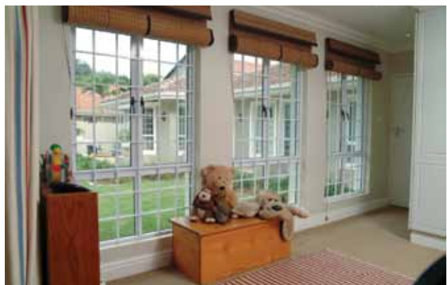
Trellidor Cottage Guard can match or mimic cottage pane windows.

This is Trellidor's premium quality, fully framed burglar guard. They are custom measured and made to either match existing cottage pane windows or create a cottage pane effect. Trellidor Cottage Guard units are manufactured from a combination of aluminium rectangular tubing with a reinforced steel bar through the centre to increase their ability to fend off an attack. They require no welding and are bolted into the substrate of the window with coach screws to help resist break-ins. There are very few products on the market to challenge the strength of these burglar guards. Ask your Trellidor consultant for more information on this product.