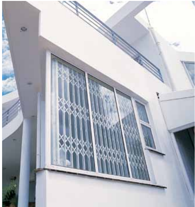
Trellidor Fixed Security barriers help protect windows from unwanted intrusion.

Trellidor Fixed Security barriers are manufactured at our ISO audited factory and are SABS approved.