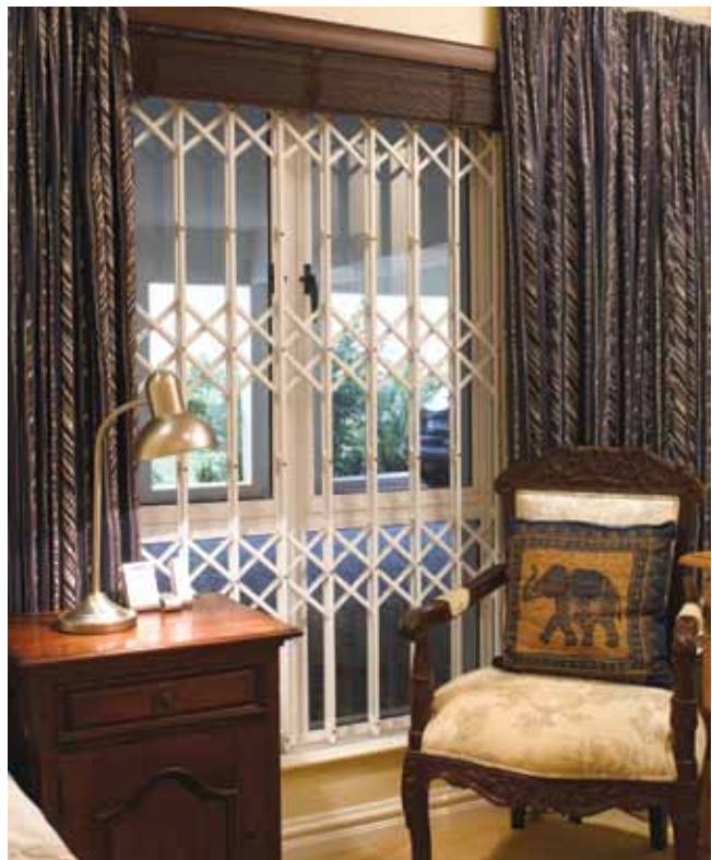
Our fixed security barriers can be designed to fit any size window.