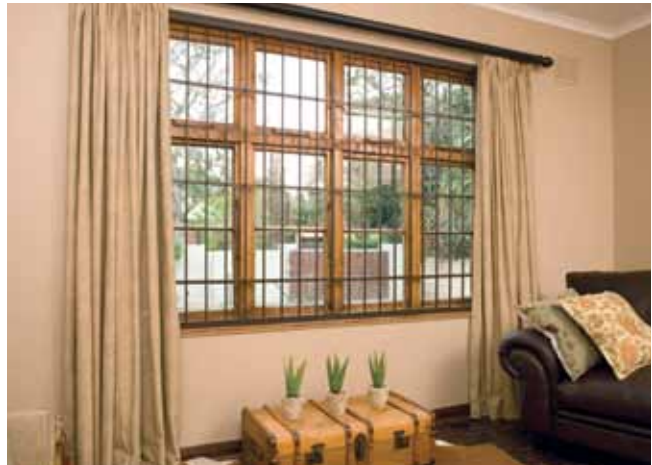
Trellidor Burglar Guard design with uprights and horizontal strengthening bars. These can be matched to window frames making them less obtrusive.

All designs are available in 3 standard and 3 non-standard powder coated colours to match decor and finishings. They carry a warranty of 3 years inland and 1 year at the coast.