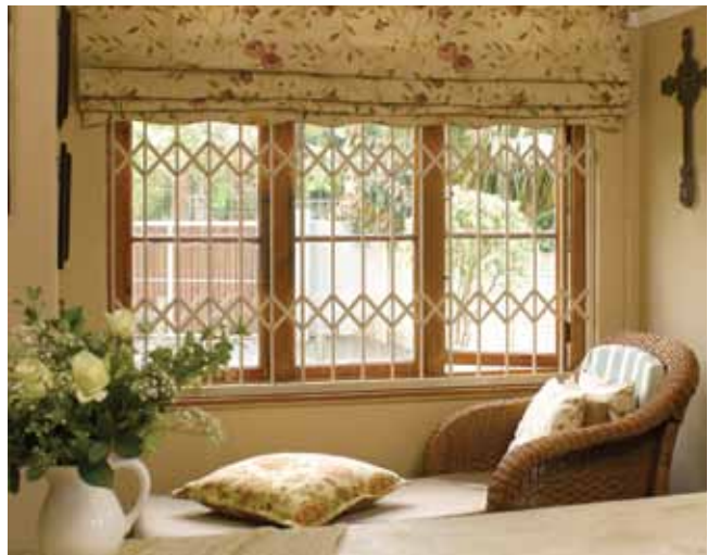
Trellidor Burglar Guard single trellis design for a less cluttered look.